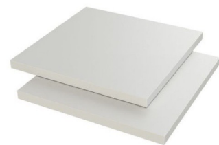
Coverwall sheet material

Installed with adhesive and finished with trims or sealant, Coverwall helps create a smooth finished surface with a professional appearance.